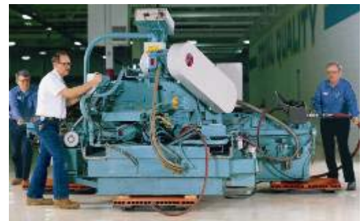
Air Caster Rigging System makes it easy to move machines like the unit shown above.

AeroGo systems are more cost-effective than traditional load movement methods – and much easier to operate. Plus, there are no moving parts so maintenance costs are low.